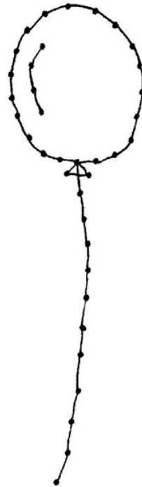
Pattern with thread - example

Line the pattern over cardstock paper. Punch only the dots with an awl or a push pin through the pattern and the cardstock. Only punch holes where the dots are shown on the pattern. Then stitch through the punched cardstock using a cross-stitch needle and thread. Use all 6 strands of thread and tie knots on the under side when you begin and when you finish. Look at the stitched example for help.